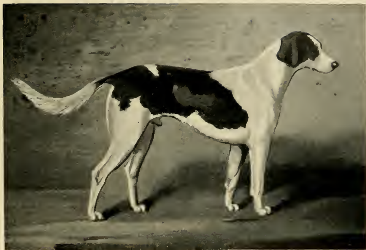
A DOG HOUND